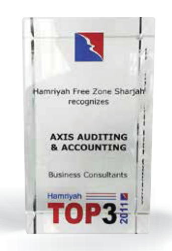
Business Consultants Award (2011) Top- 3