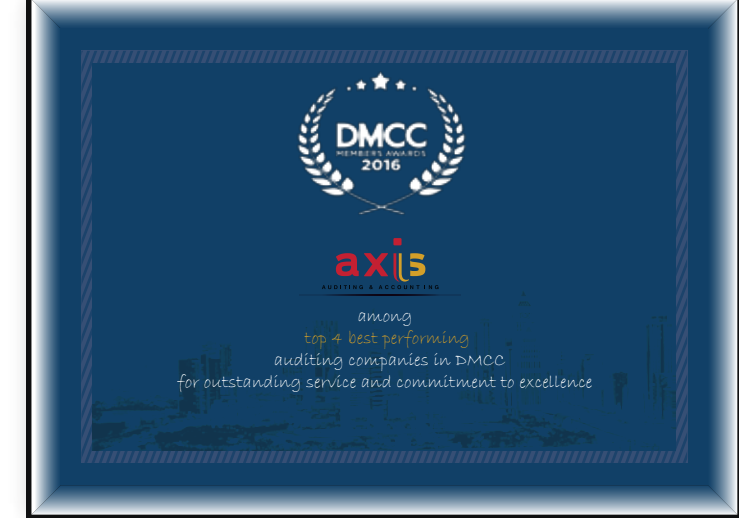
Nominee Finance Award (2016) Top - 4 DMCC