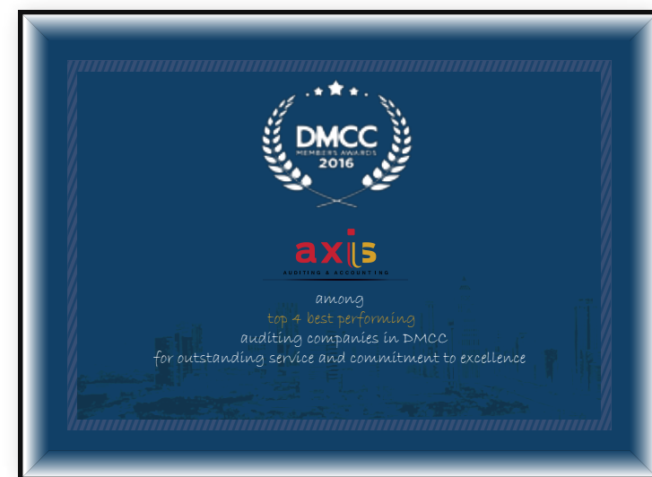
Nominee Finance Award (2016) Top - 4 DMCC