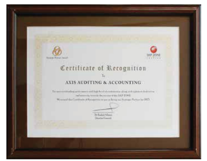
Strategic Partner Award (2013)