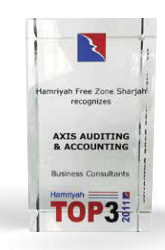
Business Consultants Award (2011) Top- 3